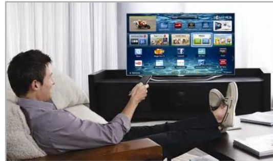
*All images are copyright of their respective owners